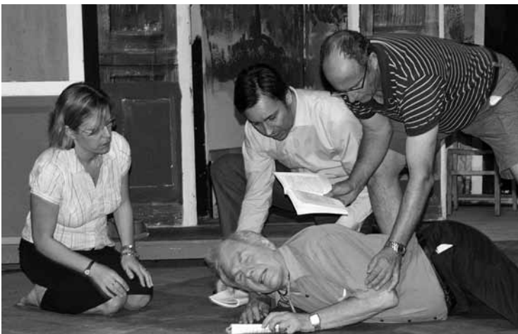
The Sunshine Boys in rehearsal