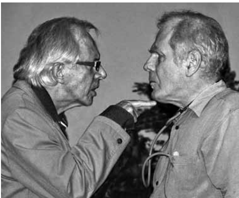
The Sunshine Boys in rehearsal